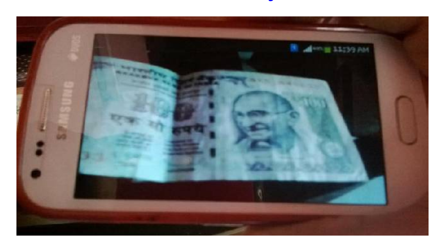
Fig.2. Android Based Currency Recognition System

The paper [4], presented by Mirza and Nanda describe an Automated paper currency recognition system can be a very good utility in banking systems and other field of commerce. In this article, recognition of paper currency with the help of digital image processing techniques is described. Three characteristics of Indian paper currency is selected for counterfeit detection included identification mark, security thread and watermark. The characteristics extraction is performed on the image of the currency and it is compared with the characteristics of the genuine currency. The sobel operator with gradient magnitude is used for characteristic extraction. Paper currency recognition with good accuracy and high processing speed has great importance for banking system. The proposed method has advantages of simplicity and high speed.